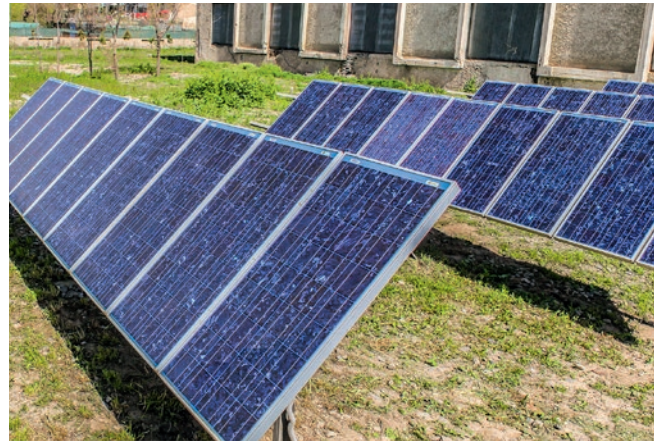
Renewable energy systems were handed over to the Afghan energy supplier

With its five-year plan, the Afghan government ushered in an energy transition in mid-2016 which gears energy supply more strongly to renewable energies, domestic production and market conditions. Ministries, provincial authorities and