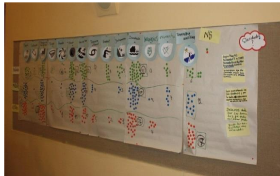
Participatory planning process

Urban mangroves have been exposed to high levels of pollution, deforestation and degradation, affecting their resilience and ability to provide quality ecosystem services to local communities in Cartagena. The GIZ's EbA Project and Ecosystem-based adaptation strategies in Colombia and Ecuador programme is implementing pilot projects for the restoration of mangroves in particularly vulnerable areas of the coastal lake of Ciénaga de la Virgen. This is the result of a planning process among approximately 40 institutions. A 4-step approach was applied during an expert workshop to identify and prioritize EbA measures: