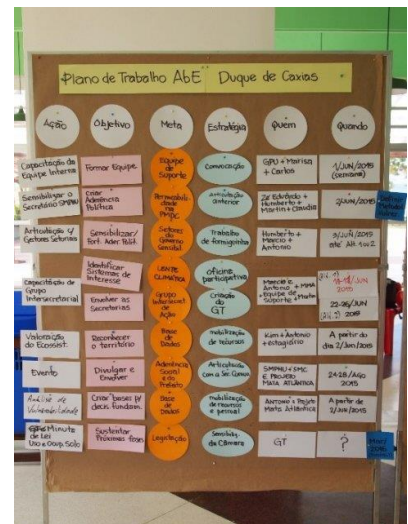
Work plan for Duque de Caxias