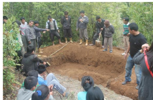
Percolation pit

The project, through partnerships with several institutions and technical experts, brings an innovative scientific approach to the identification and resolution of water management issues. It also links these new methodologies with government schemes such as MGNREGA and the National Rural Drinking Water Program for kicking off a structured implementation of water sector reforms. These endeavours have opened up people's perceptions of power over their local natural resources. It has mobilized communities to address their local governments, seeking resources to carry out interventions on their own.