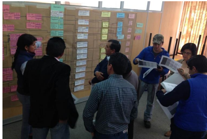
Local stakeholders in Tungurahua conducting a participatory risk and vulnerability assessment using the MARISCO method