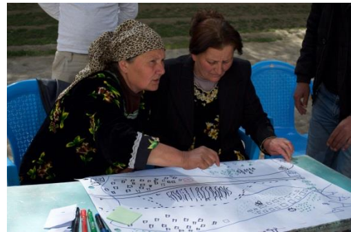
Participatory planning process

EbA should be considered as part of an overall adaptation strategy and works best when combined with other adaptation measures, which are valid for implementation since they also went through the whole selection process and are ecosystem friendly,.