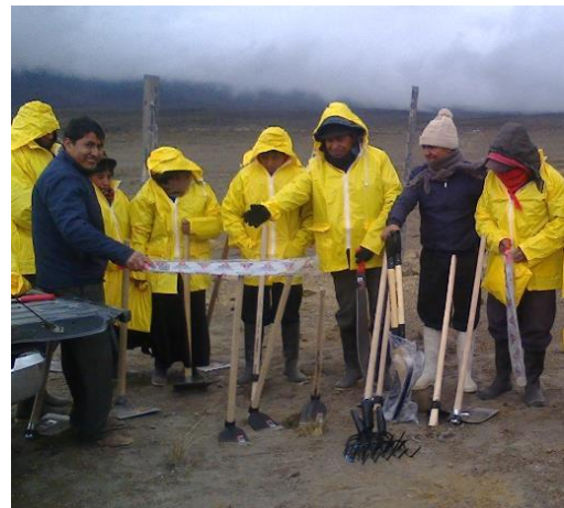
Local parish government of Pilahuín and community members set to work in their forest management association with newly acquired tools.